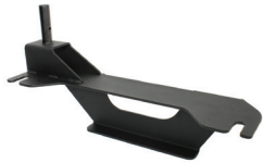
No Holes Base 425-5654