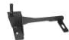
1 No Holes Base 425-3243R

NOTE: Insert the ratchet handle through the unthreaded side of the articulated swing arm and tighten.